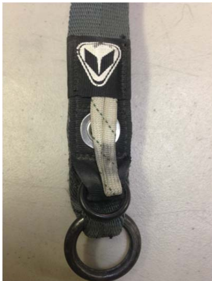
Figure 3: Normal Wear, Front

The following pictures show locking loops with normal wear.