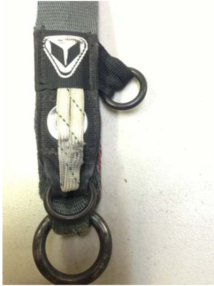
Figure 5: Damaged, Frayed

The following pictures show locking loops with damage; heavily frayed and partially cut.