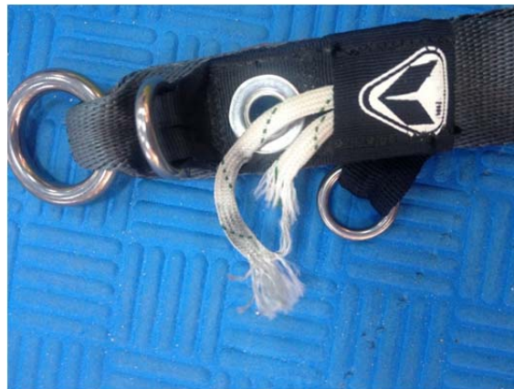
Figure 10: Damaged, Partially Cut