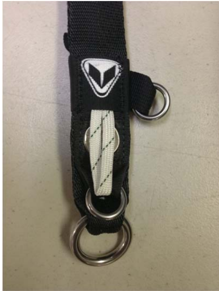
Figure 3: New Locking Loop

The following picture shows a new riser locking loop.