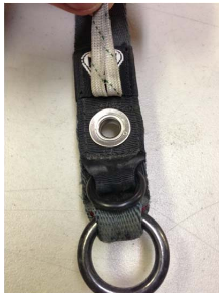
Figure 4: Normal Wear, Back