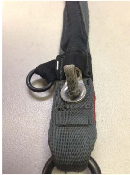
Figure 6: Damaged, Frayed