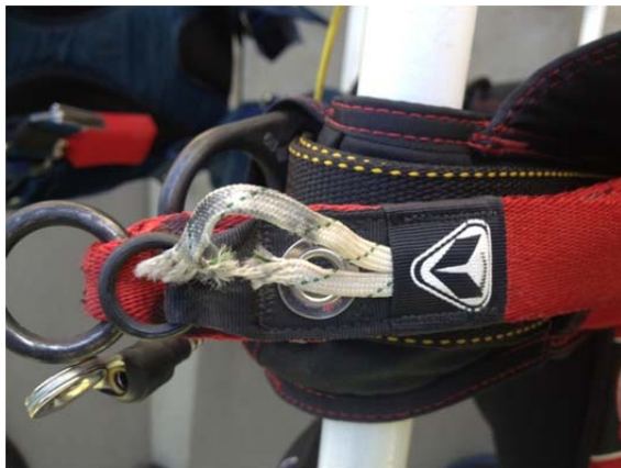
Figure 9: Damaged, Partially Cut